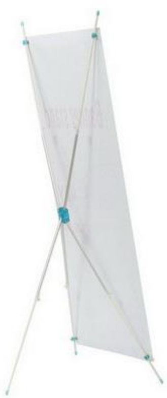
XB - Telescope