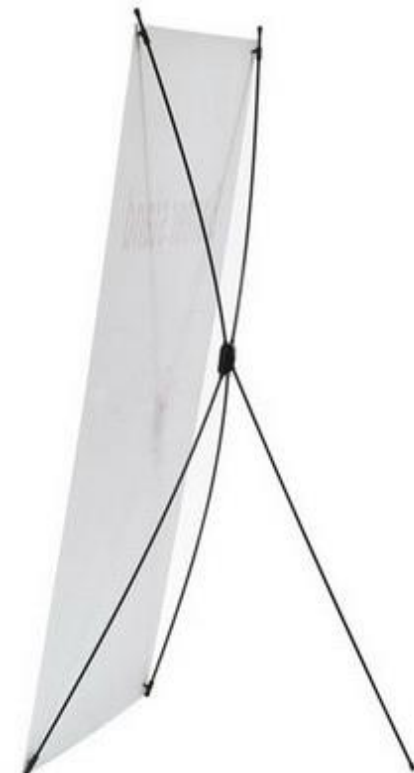
XB - Eco