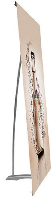
TLB - Mini