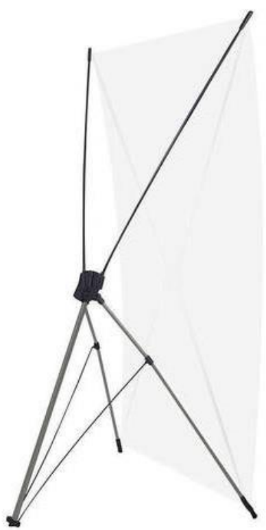
XB - Basic