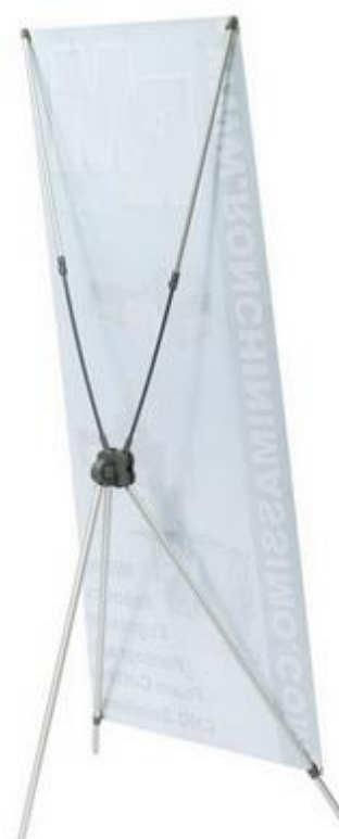
XB - Classic