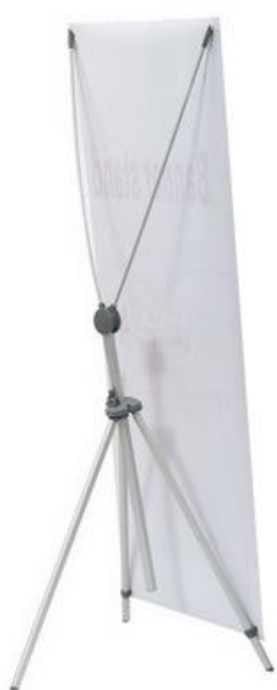
XB - Smart