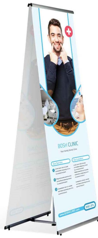
LB - Pro D