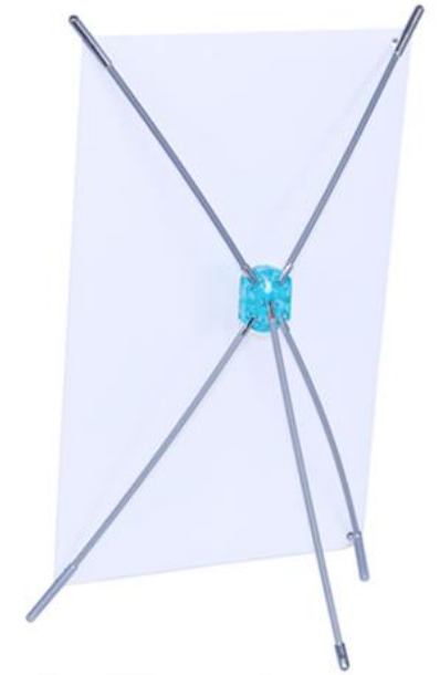
TXB - Mini