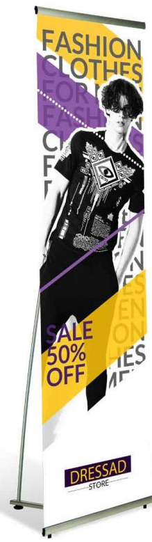
LB - Pro