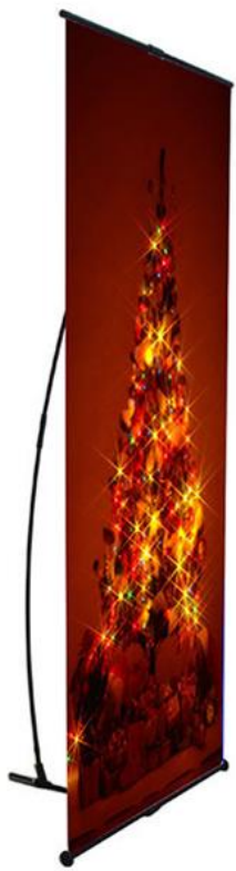
LB - Light