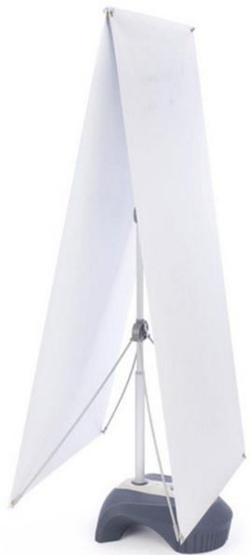
OXB - Pro D